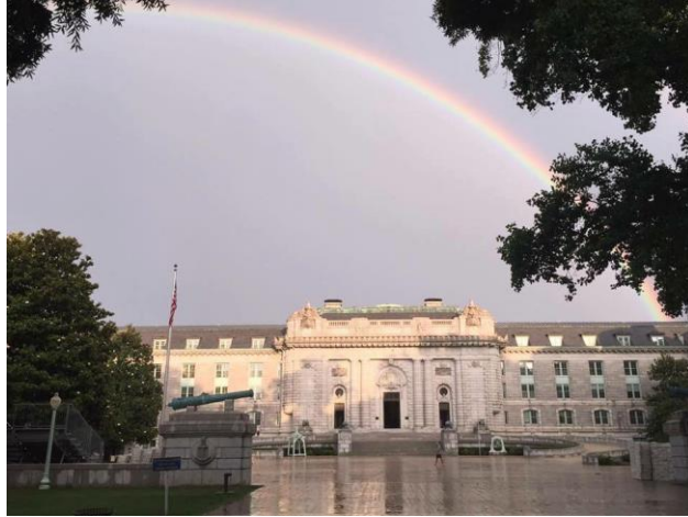
Bancroft Hall the largest dormitory in the world.