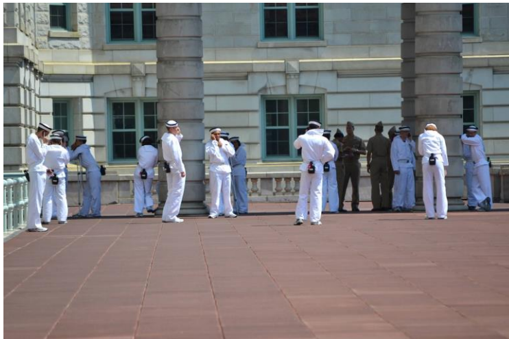
Plebe summer scheduled phone call

For the six weeks from I-Day to Parents' Weekend, parents are not allowed to make personal contact with their son or daughter. Three scheduled phone calls will be your only contact outside of writing. You may want to consider having a list of questions ready before the phone calls. Be aware that the phone calls often start late and that your Plebe may not be completely alone when they call. In general, let your Plebe control the flow of the call. Plebes are allowed to take their cell phone on I-Day. They will turn it in and it will be returned to them to make these scheduled phone calls. Make sure the phone is fully charged on I-Day. Should the phone not have a charge, an alternate phone will be provided for the plebe to call. ALWAYS answer your phone on call days even if you do not recognize the inbound phone number. There is no opportunity for you to return the call at your convenience. If your Plebe needs someone with whom to talk there will be Chaplain's Hour that will allow Plebes to spend time with a Chaplain if desired.