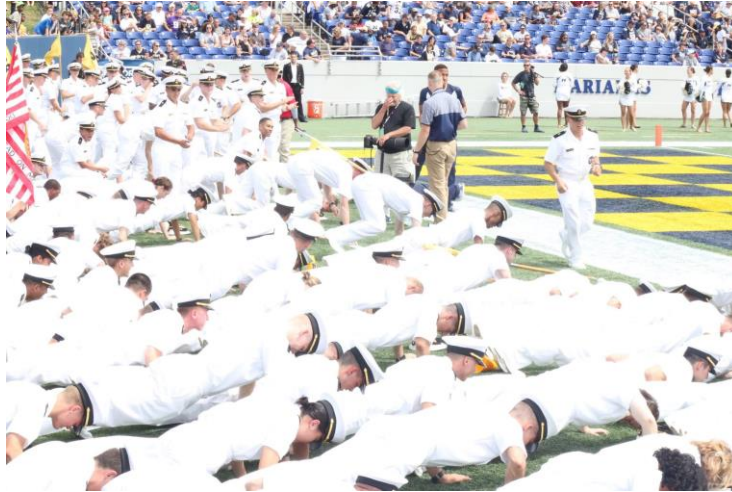
Plebes do pushups after every score

In addition to Club sports, there a wide ranging number of service, language and special interest Clubs. Mids have an opportunity to talk with those involved at a special event in the fall.