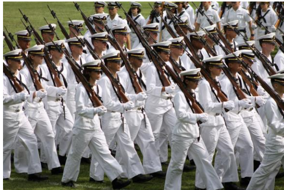
Plebe Summer Parade